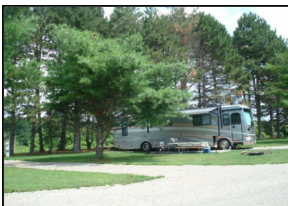
Typical RV Site