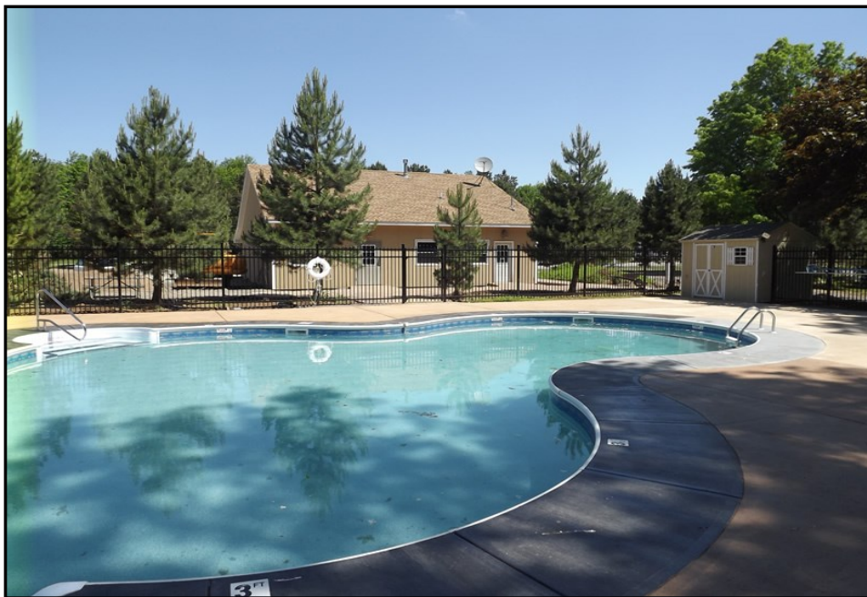
Pool Complex at RV Area